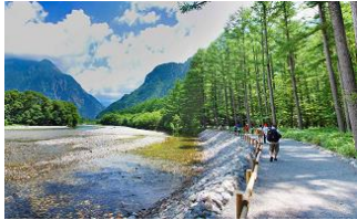
Mountain Trail Most used in summer