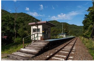
Secluded Station Peaks on public holidays