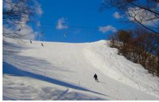
Ski Resort used in winter