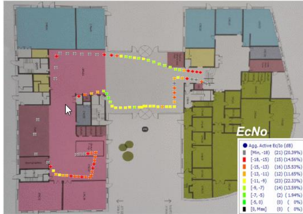
After: Macro + small cells